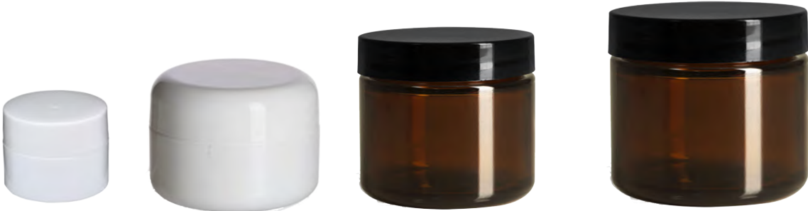
1/4 oz plastic